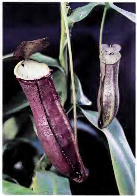
Figure 2: N. gracilis cv. 'Nighttime Regal'